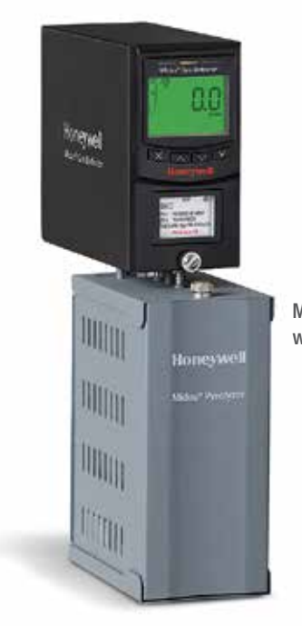
Midas Gas Detector with Midas Pyrolyzer

Offered as an option, the Midas Pyrolyzer allows for the detection of NF<sub>3</sub> and other CFX gases. Cost of ownership is low, as the Pyrolyzer has a replaceable heater assembly with a lifespan of greater than two years. Even more, thanks to our new proprietary catalyst to improve efficiency in gas conversion, the Pyrolyzer delivers automatic flow control, temperature control, and fast and accurate performance. Additionally, the Pyrolyzer can run from a Midas Gas Detector that's powered by either PoE or 24 VDC.