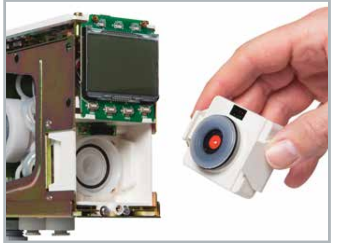
Midas Gas Detector plug-and-play sensor cartridge allows quick and easy sensor replacement