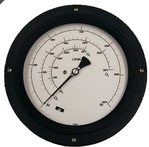
Ar, O<sub>2</sub>, N<sub>2</sub> Tri-Scale Dial