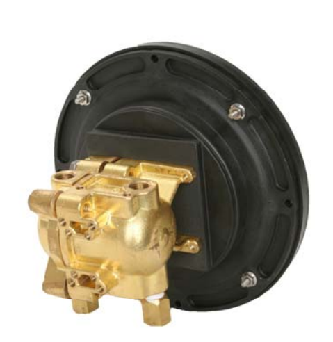
Model 116 Brass Cast Body

Model 116 can be equipped with one ore two independently adjustable SPDT snap acting Micro-Switches which can be set on decreasing or on increasing pressure. A switch adjustment screw and a switch lock screw is accessible after removal of the lens and bezel (removal of 4 screws). Interface to the snap acting micro-switch is via color coded 18 AWG flying leads and a ½ FNPT conduit connection. Model116 with switch temperature limits are rated at -20°C to +185°F